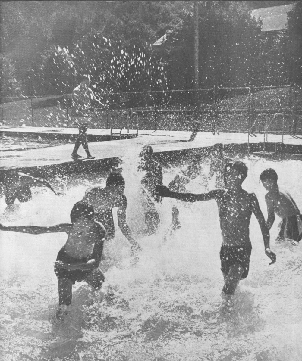
At Connecticut's Southbury Training School, retarded youngsters romp in a pool they helped build preparing for useful lives outside.